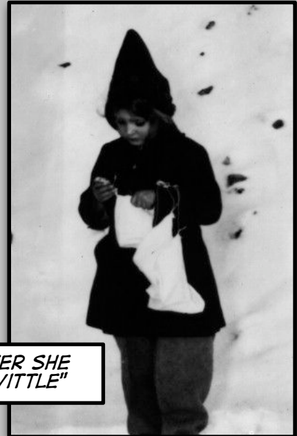
A GERMAN GIRL AFTER SHE CATCHES A "LITTLE VITTLE"