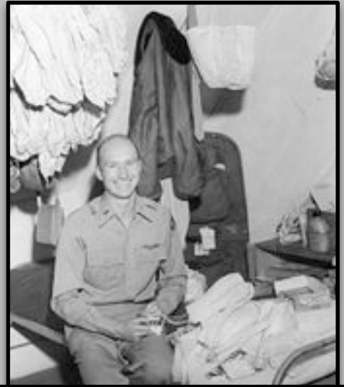
HALVORSEN MAKING PARACHUTES OUT OF HANDKERCHIEFS

THE VERY NEXT DAY, ON APPROACH TO BERLIN, HE ROCKED THE AIRPLANE AND DROPPED SOME CHOCOLATE BARS ATTACHED TO A HANDKERCHIEF PARACHUTE TO THE CHILDREN WAITING BELOW. EVERY DAY AFTER THAT THE NUMBER OF CHILDREN WOULD INCREASE AND HE MADE SEVERAL MORE DROPS. SOON THERE WAS A STACK OF MAIL IN BASE OPS ADDRESSED TO "UNCLE WIGGLY WINGS", "THE CHOCOLATE UNCLE" AND "THE CHOCOLATE FLIER". HIS PROJECT BECAME KNOWN AS "OPERATION LITTLE VITTLES". OTHER PILOTS JOINED THE FUN, AND WHEN NEWS REACHED THE U.S., CHILDREN ALL OVER THE COUNTRY SENT IN THEIR OWN CANDY TO HELP OUT. SOON THE MAJOR CANDY COMPANIES JOINED IN AS WELL. IN THE END, OVER THREE TONS OF CANDY WAS DROPPED OVER BERLIN, AND THE "OPERATION" BECAME A MAJOR PROPAGANDA SUCCESS.