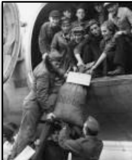
SUPPLIES WERE COLLECTED...