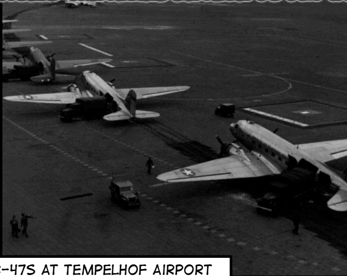
C-47S AT TEMPELHOF AIRPORT DURING BERLIN AIRLIFT.

WOULD THE ALLIES BE ABLE TO FLY IN SUPPLIES TO 2 MILLION PEOPLE?