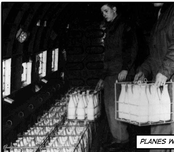
PLANES WERE LOADED.