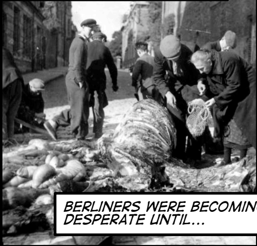
BERLINERS WERE BECOMING DESPERATE UNTIL...

WHEN THE BLOCKADE BEGAN IT WAS ESTIMATED THAT THE CITY HAD 35 DAYS WORTH OF FOOD AND 40 DAYS WORTH OF COAL