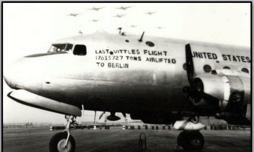
THE LAST VITTLES FLIGHT LEFT RHEIN-MAIN AIR BASE ON SEPTEMBER 30, 1949