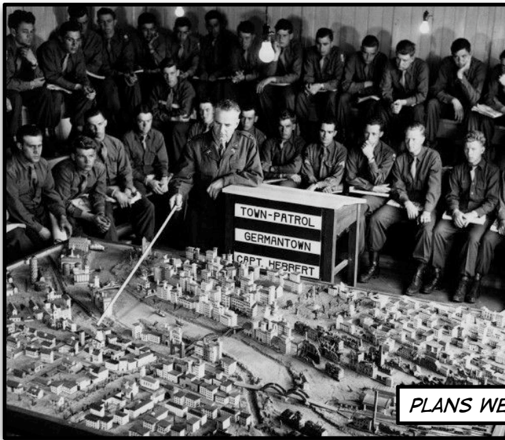
PLANS WERE MADE...